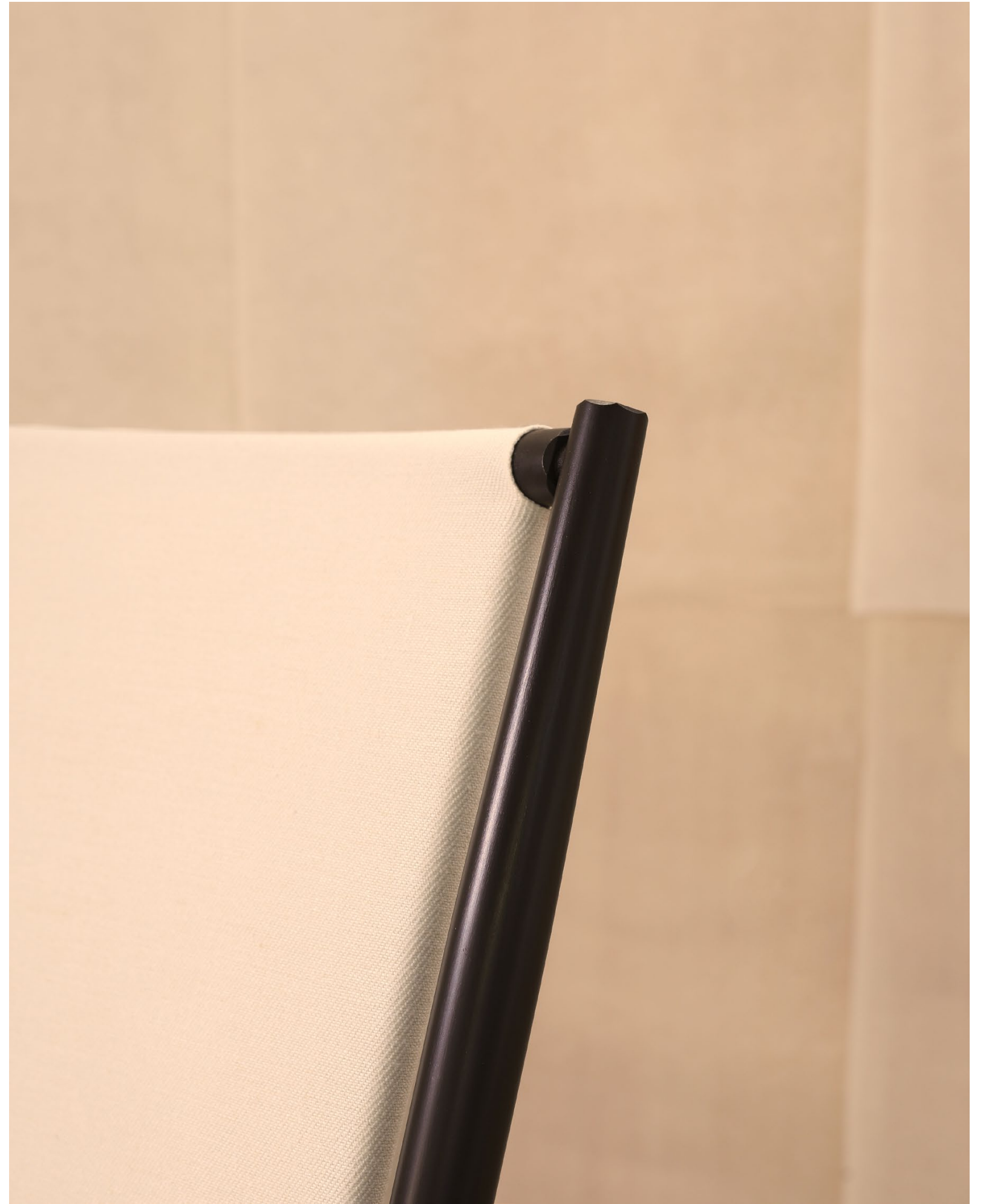
Rocking Chair with Egyptian Brace Danish Cherry, Washi Paper & Hemp Fabric