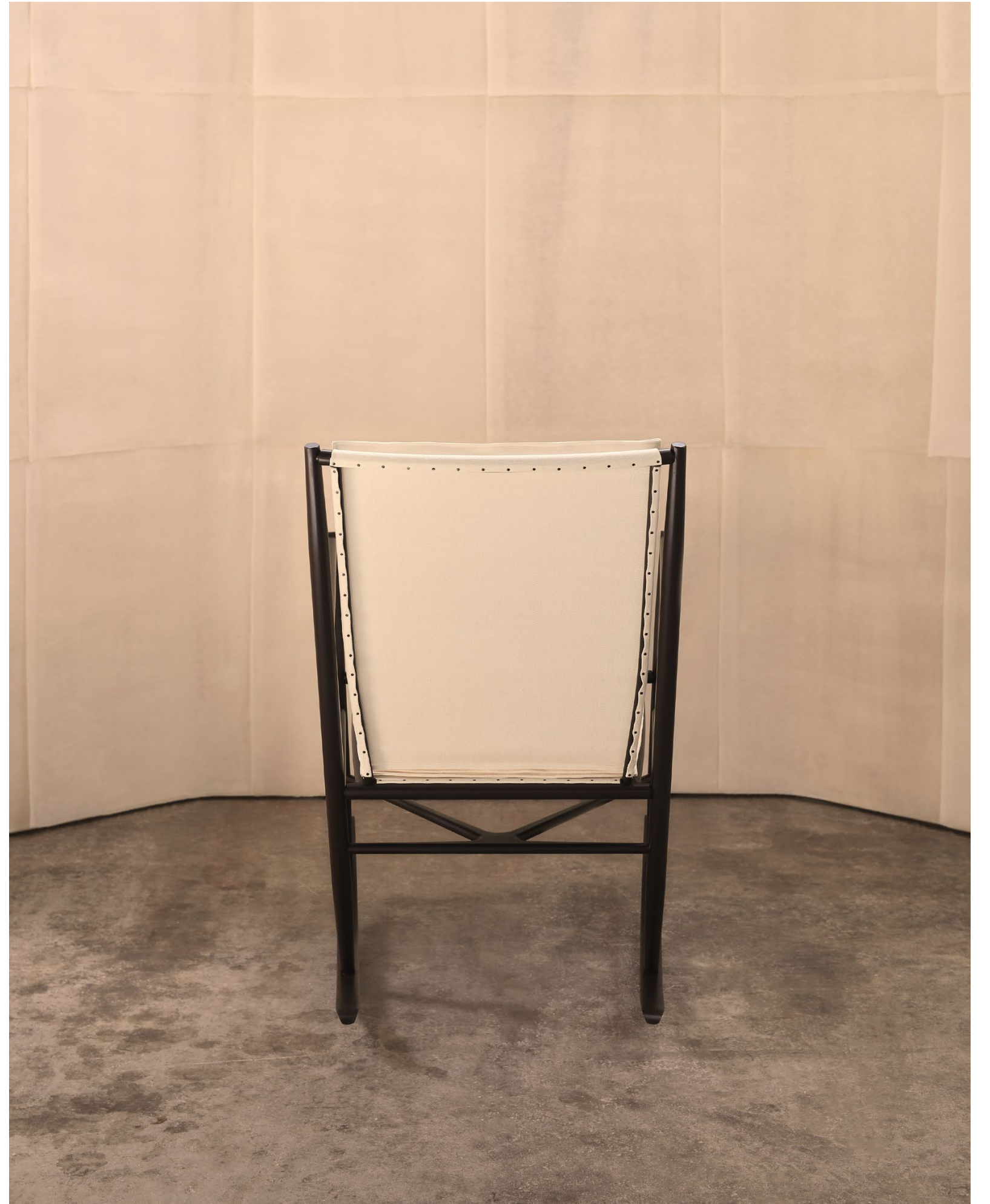
Rocking Chair with Egyptian Brace Danish Cherry, Washi Paper & Hemp Fabric