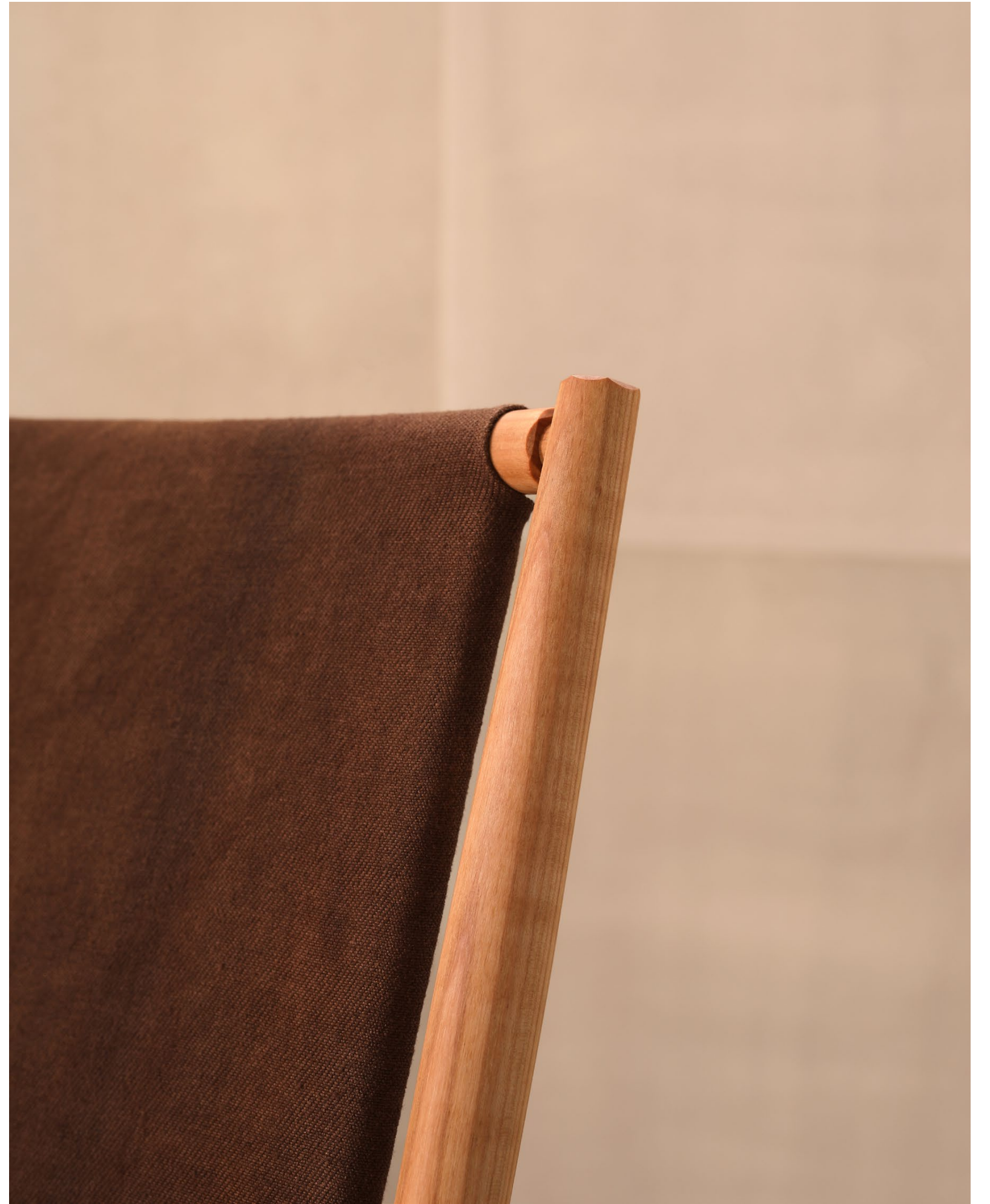
Rocking Chair with Egyptian Brace Danish Cherry, Washi Paper & Hemp Fabric