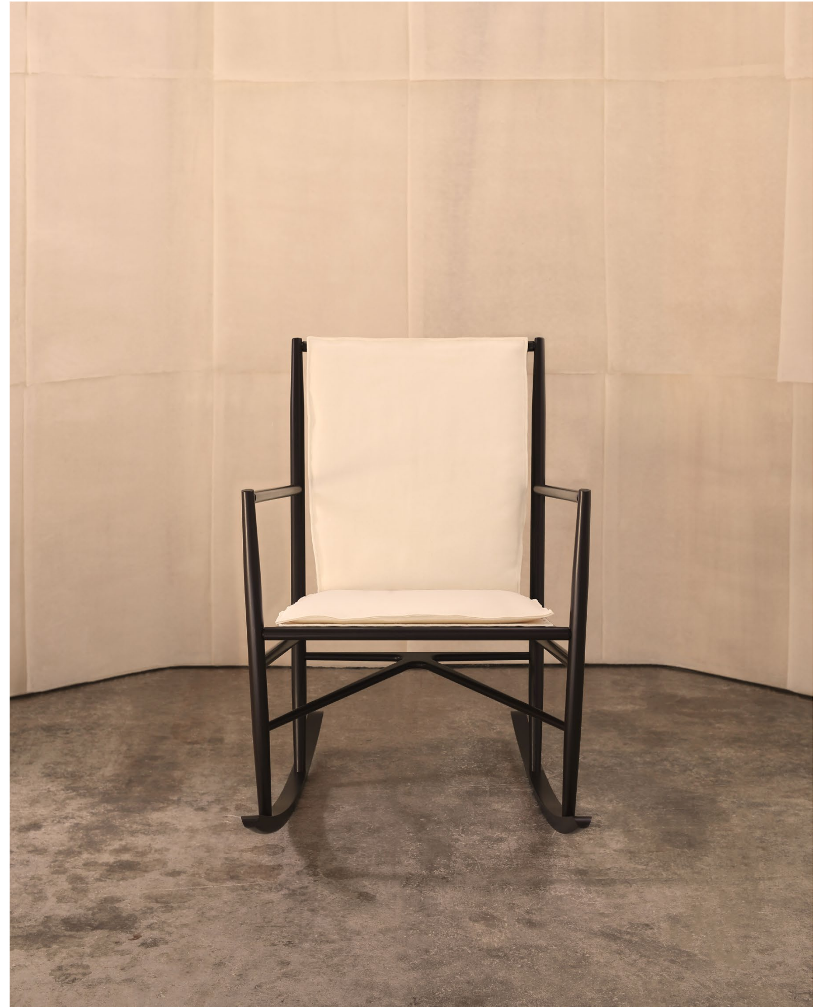
Rocking Chair with Egyptian Brace Danish Cherry, Washi Paper & Hemp Fabric