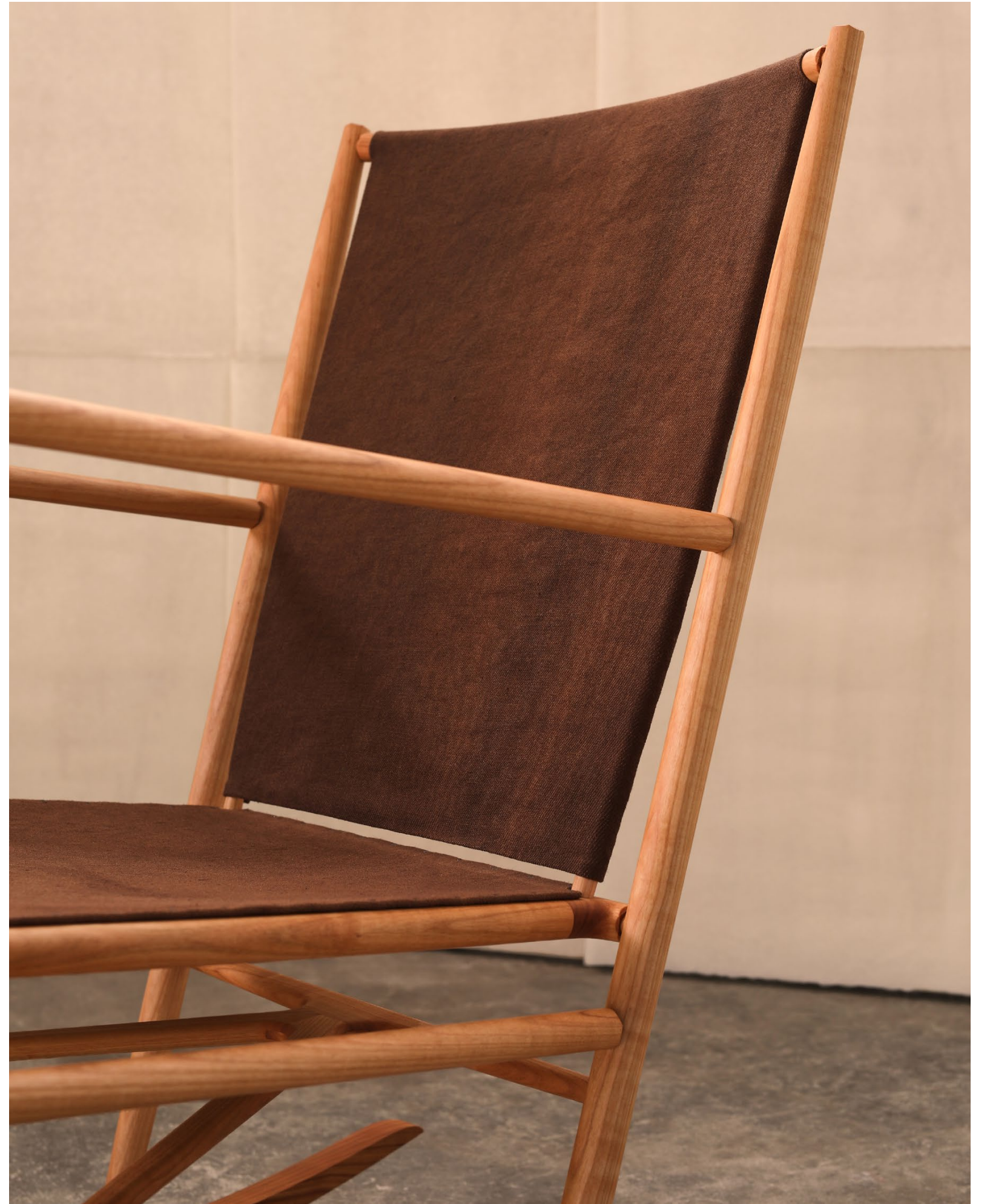
Rocking Chair with Egyptian Brace Danish Cherry, Washi Paper & Hemp Fabric