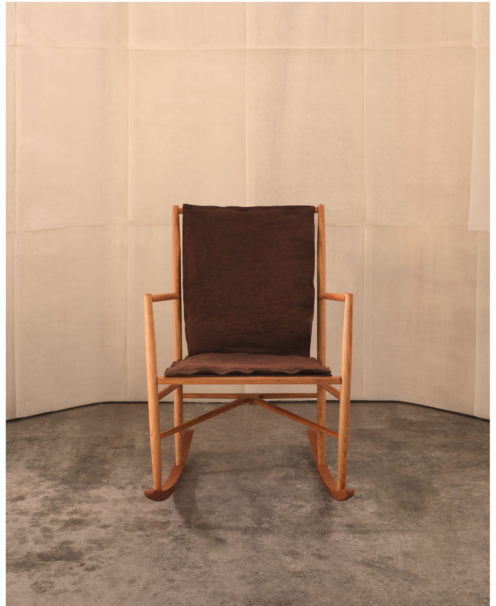
Rocking Chair with Egyptian Brace Danish Cherry, Washi Paper & Hemp Fabric